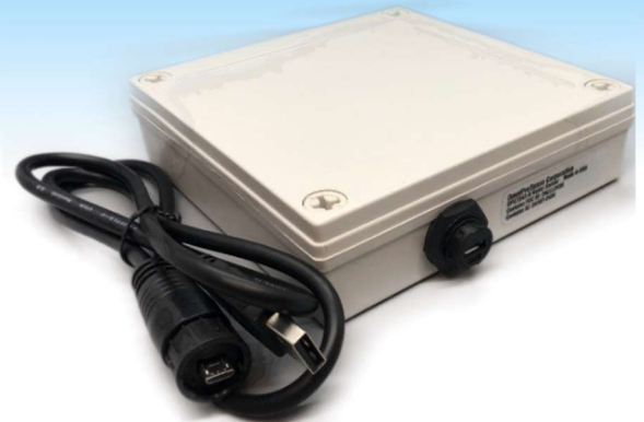
OPS7243 Radar Sensor