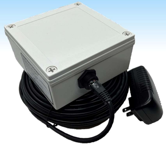
OPS8243 Traffic Monitor (WiFi version shown)