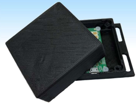
OPS242 with EM Lens Enclosure